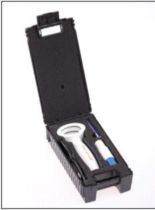
MAMBO with foam insert - perfect for medical parts