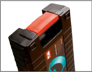
Lock with integral handle