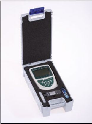
The robust MAMBO box is suitable ideally to protect sensitive measuring instruments